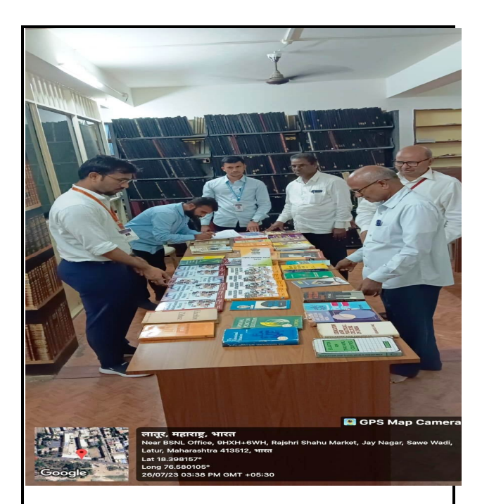
Teaching and nonteaching staff participating in the book exhibition

Student participated in the book exhibition